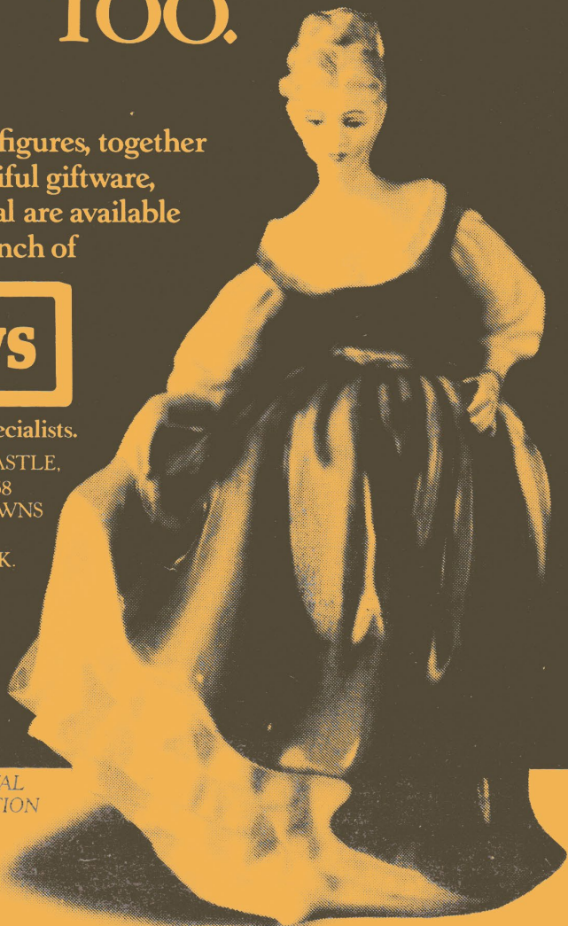
'FAIR LADY' FROM THE ROYAL DOULTON FIGURES COLLECTION

54 IRONMARKET, NEWCASTLE, STAFFS. TEL: 0782 611458 AND IN MOST MAJOR TOWNS AND CITIES THROUGHOUT THE UK.